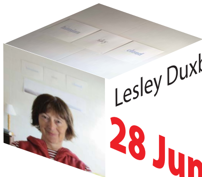
Lesley Duxbury (Australia)