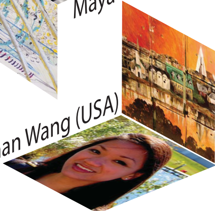
Shan Wang (USA)